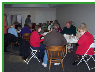
MIAC members enjoying their wonderful Irish Breakfast

Approximately thirty members attended, one of our largest groups in the last few years. This year's date is set for Nov 12, 2010, so mark your calendar for a lovely Irish morning.